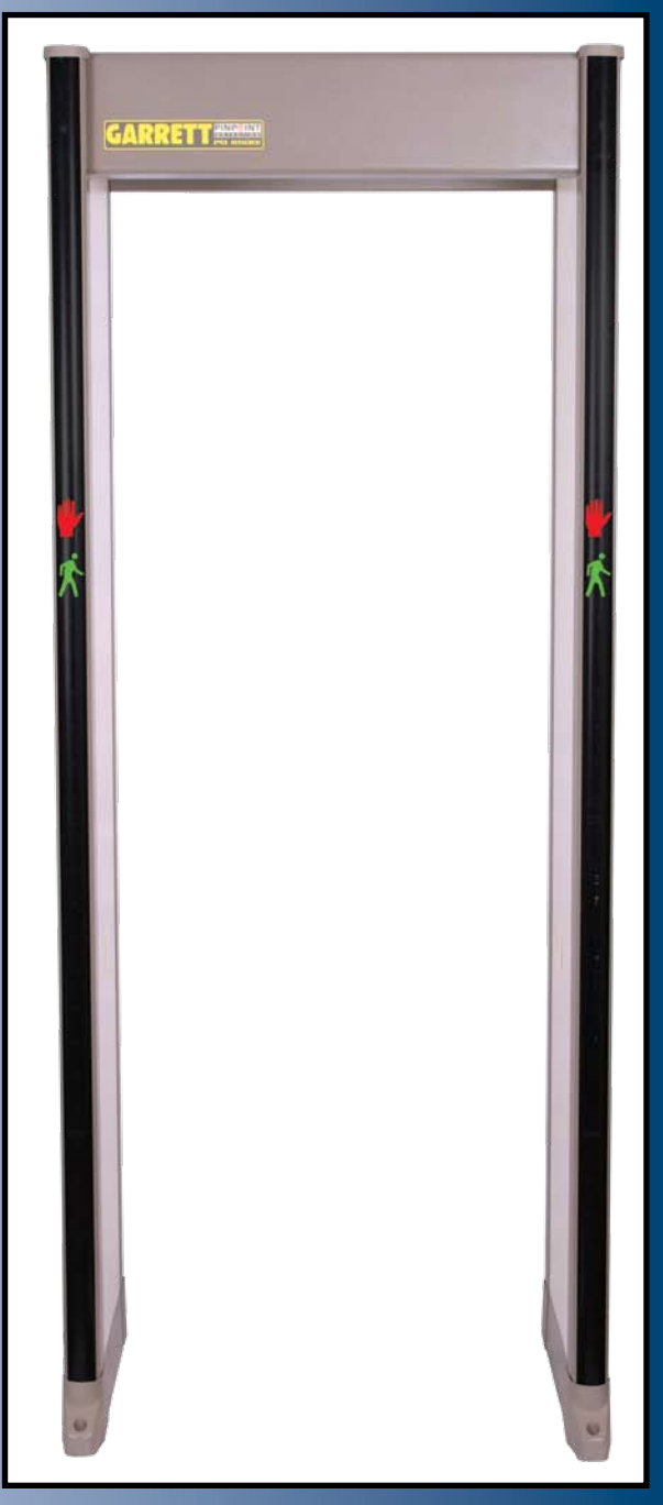
ABOVE: (Entrance view) International pacing lights illustrated.

LEFT: All connections, wires and electronics to the PD 6500 i are securely enclosed within the locking Detection Head.